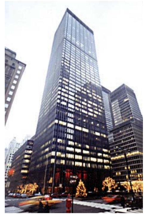
Ronsco recently completed work at the 1.1 million sq. ft. JP Morgan/Chase Building at 270 Park Avenue.

WC&C congratulates Ronsco, Inc., winner of the AWCi 2006 Safety in Construction Award. •